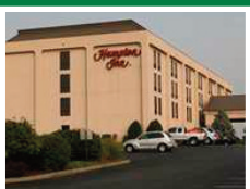
Hampton Inn 1310 U.S. 127 South Frankfort, KY 40601 (502) 223-7600