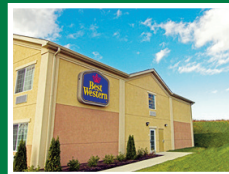
Best Western Lawrenceburg 200 Plaza Drive Lawrenceburg, KY 40342 (502) 839-3444