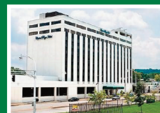
Capital Plaza Hotel (Host Hotel) 405 Wilkinson Blvd. Frankfort, KY 40601