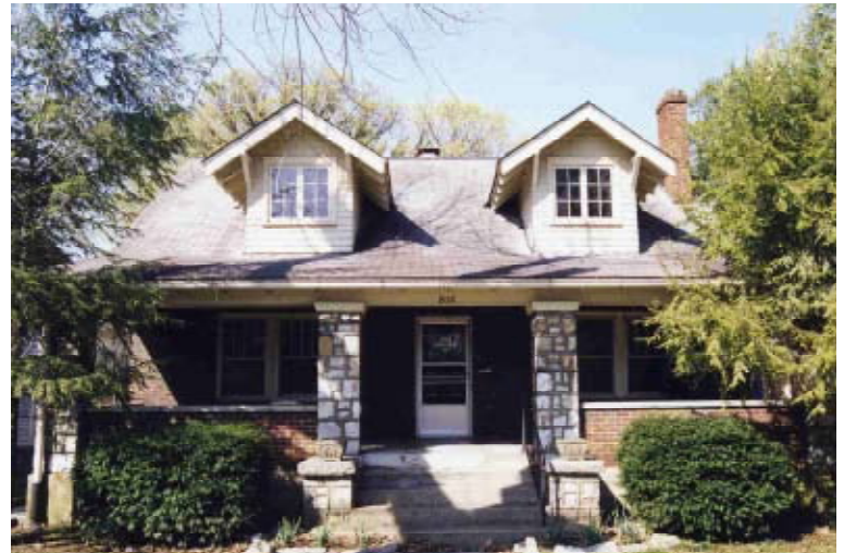
514 Logan Street played role in WWII and Korean War