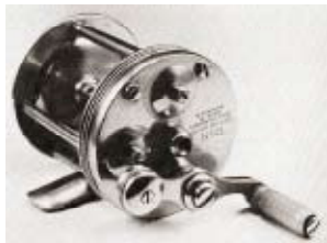
Benjamin F. Meek Reel